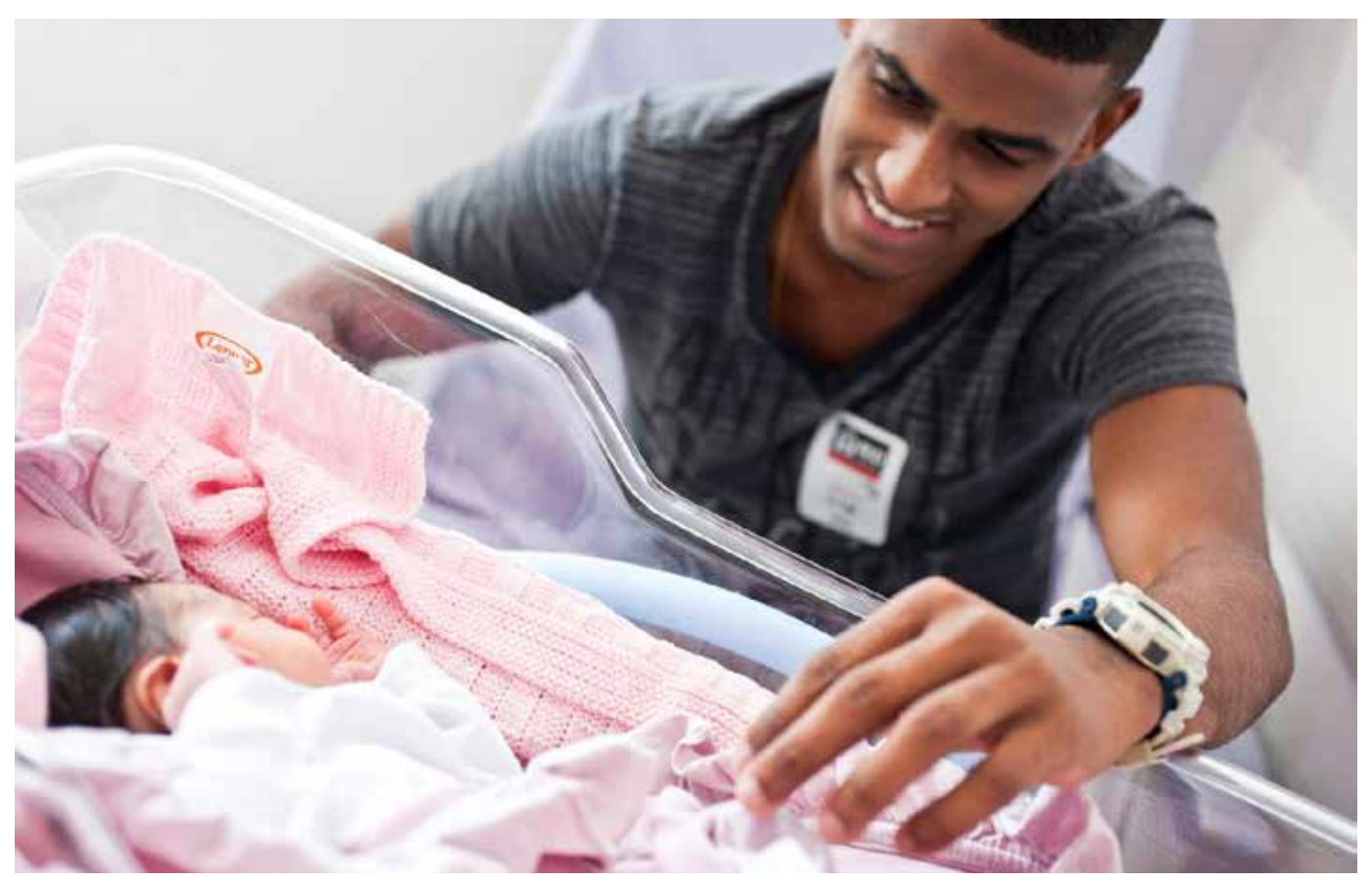
It is critical that male engagement interventions take a gender-transformative approach, by engaging participants in actively questioning what it means to be a man and a woman in society and in challenging inequitable gender norms and power imbalances. XIII The evidence-base